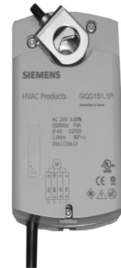
GQD Series Spring Return Direct Coupled Electronic Damper Actuator.